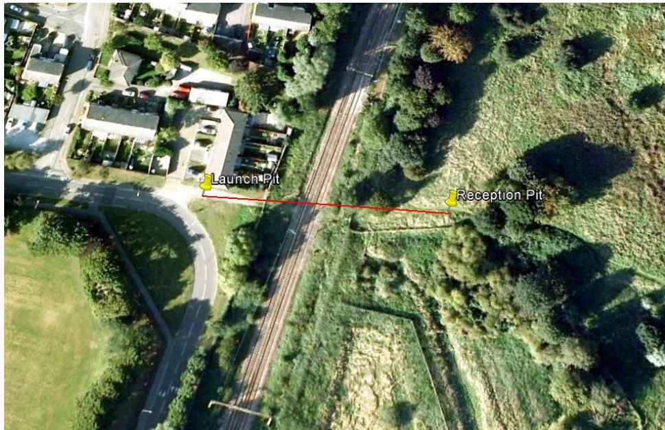
Aerial photograph showing the drill site

The project presented many challenges to AMS No-Dig's engineers. Firstly access to the reception area was difficult due to it being located in a designated Site of Special Scientific Interest (SSSI), and the only possible access to this site involved a very low bridge at the side of the River Lea, with just enough clearance for our Bobcat Utility Vehicle. This vehicle was used throughout the project to transport operatives and small hand tools to the reception area.