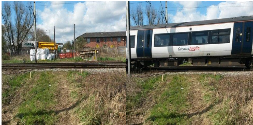
The Drill site from the reception pit side of the railway

The wireline guidance technique used on this project provides real time positioning of the drill string. Sensors located within the downhole probe, which is fitted behind the drill head provide constant update of inclination, azimuth and tool face orientation to the surface via a wireline through the drill string. The data is processed using surface equipment (interface unit, laptop computer and a printer), and specialised steering software to provide information on depth, drill distance and distance from the predetermined azimuth (right/left). The probe is 1.75 inches x 3.8 feet, and accuracy of inclination is +/- 0.1, accuracy of azimuth is +/- 0.3 and accuracy of tool face is +/- 0.1.